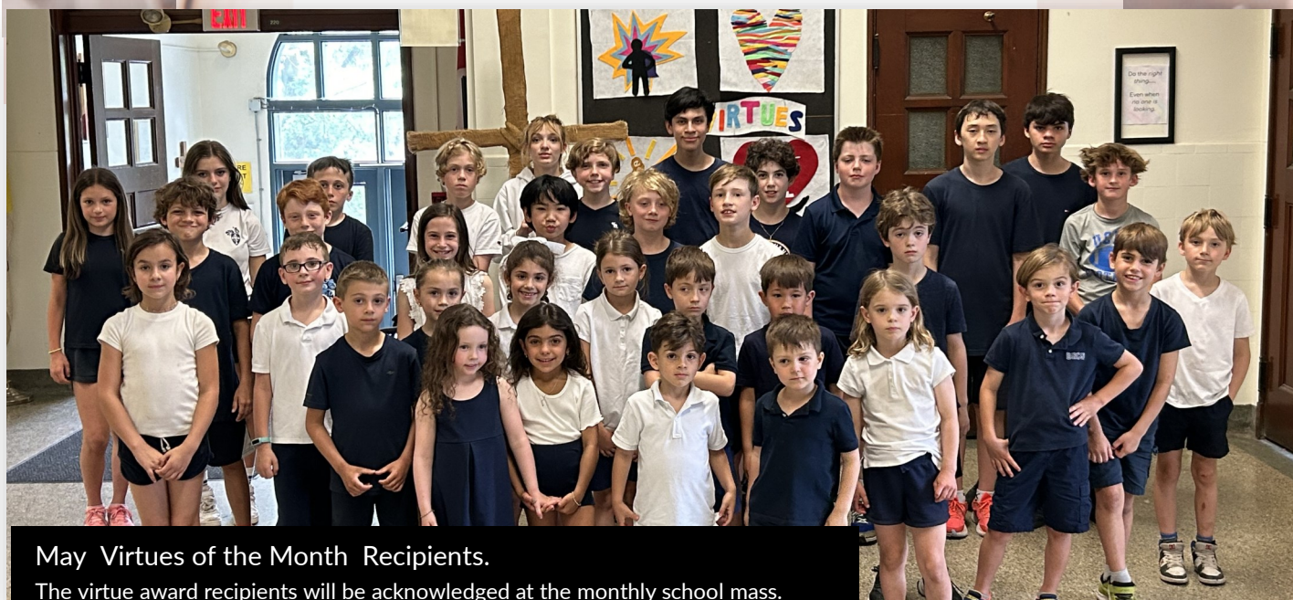
May Virtues of the Month Recipients.

Be kind and compassionate to one another, forgiving each other, just as in Christ God forgave you.